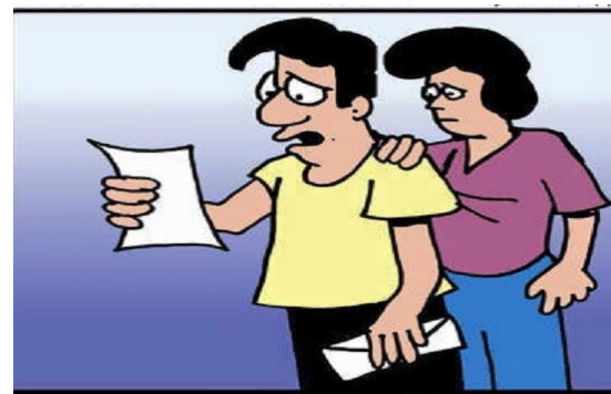
“It’s from our church... we’ve been called up for active duty.”